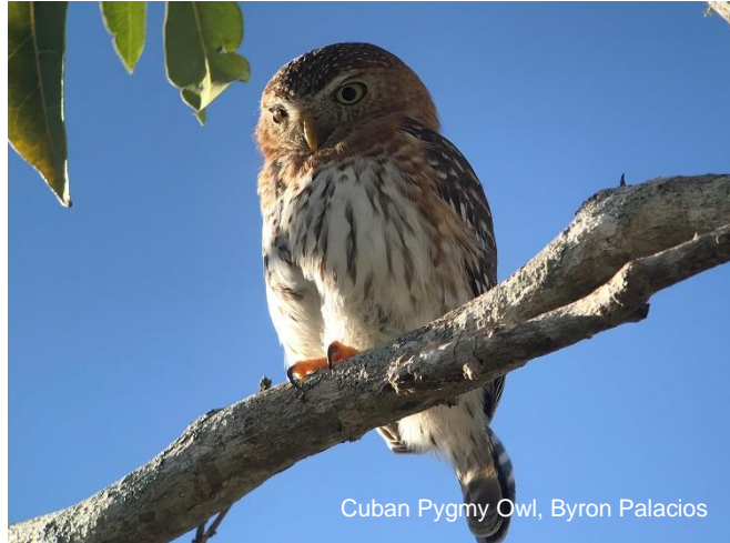
Cuban Pygmy Owl, Byron Palacios

We then backtrack on ourselves and head north to our next destination, Cayo Coco, where we stay for three nights. The journey along a mostly deserted highway will take us through the beautiful Sierra de Cubitas Mountains, a beautiful mountain ridge which offers a rich Caribbean evergreen gallery- forest located 30km north of Camagüey, great habitat for some endemics such as Cuban Bullfinch, Oriente Warbler, and with a bit of luck the rarities Cuban Gnatcatcher and Gundlach's Hawk.