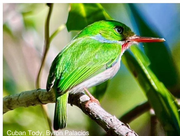
Cuban Tody, Byron Palacios