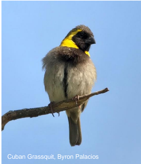
Cuban Grassquit, Byron Palacios

Cuba is just 90 miles from the southern coast of Florida but in almost every respect it provides a complete contrast with its affluent neighbour, not least in the Socialist ideology which has shaped