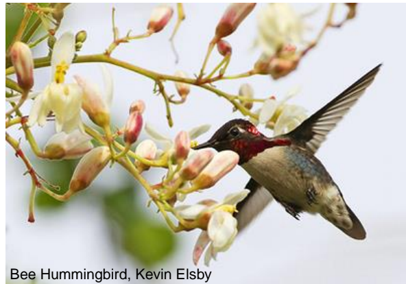
Bee Hummingbird