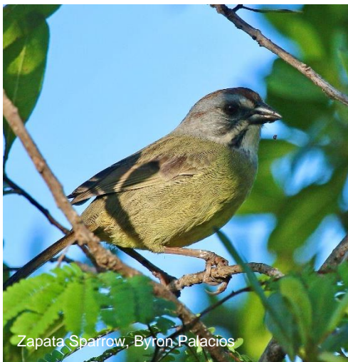
Zapata Sparrow, Byron Palacios

We spend the next couple of days exploring the different habitats in this delightful area and no doubt retiring to the hotel bar from time to time for some liquid refreshment! Cayo Coco is situated on an island off the north coast of Cuba connected to the mainland by a causeway. The chaos of islands here are part of a jumbled archipelago which extends for a considerable distance along the coast providing an infinite variety of remote sandy beaches to lure sun worshipers. Mangrove thickets and tangles of scrub conceal a number of interesting birds, and expanses of mudflats revealed by the retreating tide are a magnet for waders. Swamps and