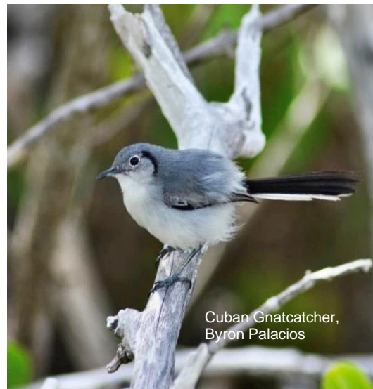
Cuban Gnatcatcher, Byron Palacios

We shall also bird the coastal scrub next to the lighthouse as it is the only place in Cuba to see Thick-billed Vireo and is also a top spot for the endemic Cuban Gnatcatcher – a superb little gem, Oriente Warbler and Mangrove Cuckoo. The beach may also have Piping Plover and this is a hot migration site, so anything could turn up!